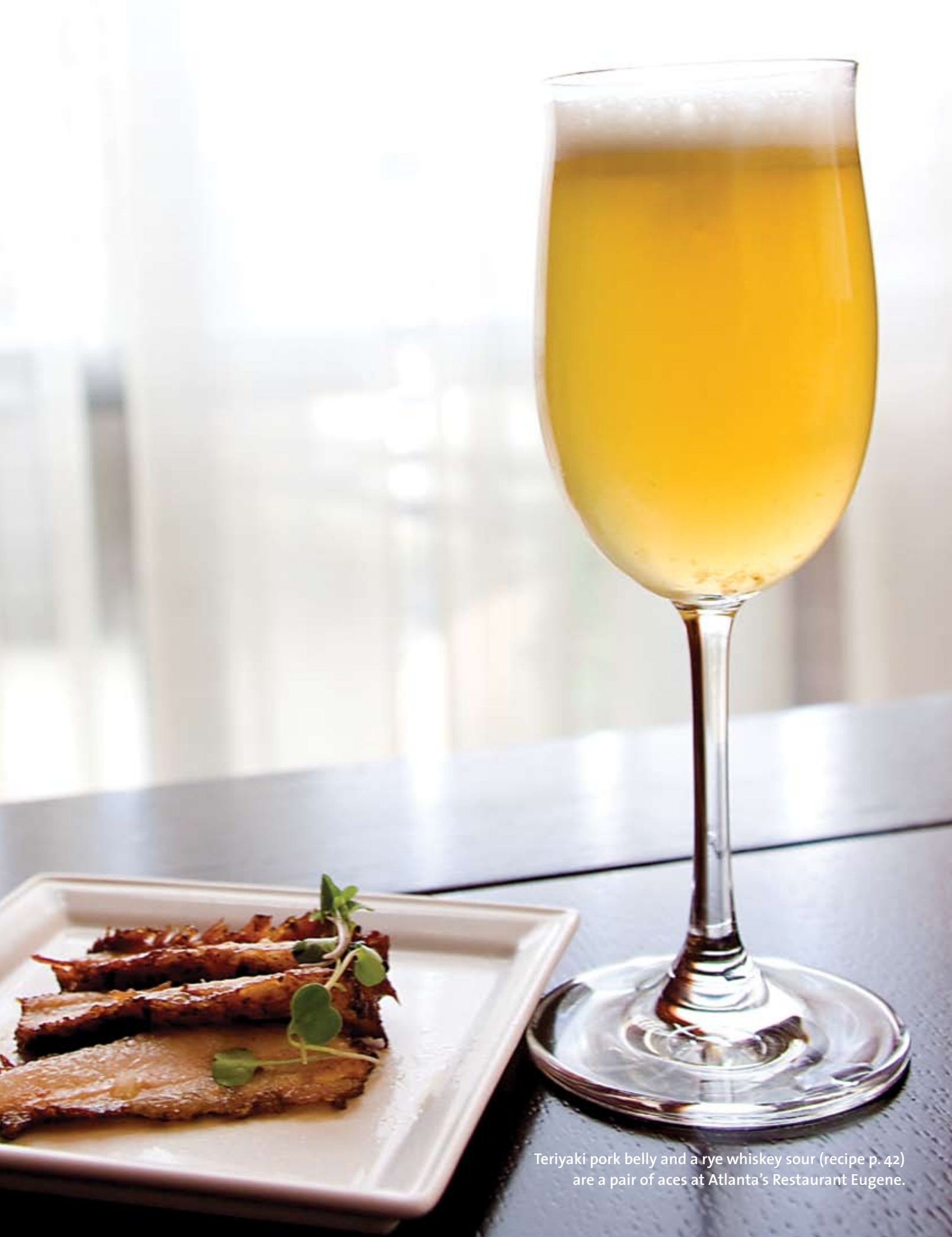
Teriyaki pork belly and a rye whiskey sour (recipe p. 42) are a pair of aces at Atlanta's Restaurant Eugene.